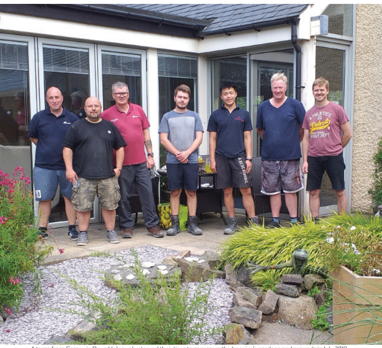
A team from Cemex in Dove Holes volunteered their time to spruce up the hospice's gardens and grounds in July 2019